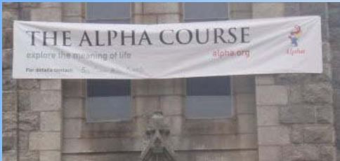
Banner on Roundwood Catholic Church

We are planning to launch an advertising campaign in Dublin South / Dun Laoghaire / N. Wicklow from 19 th Sept—3 rd Oct . This Campaign will encourage people of all ages to attend one of the 20+ Alpha Courses running in Churches / Parishes starting in the first week of October 2011. Our aim is to encourage people to ask “What is the meaning of life?” and to find the answer through attending an Alpha Course.