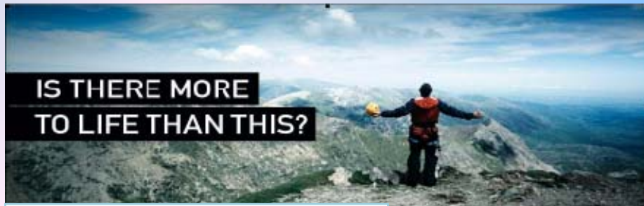
Bear Grylls on Mount Snowdon, Wales